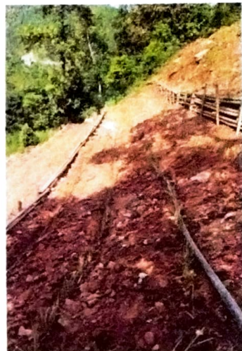
Vetiver grass as a bioengineering tool SLOPE STABILIZATION